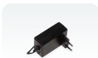
48 V 0.95 A power adapter