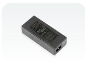
48 V 2 A power adapter