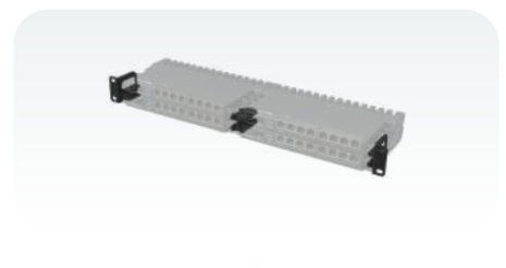
Rackmount kit K-79