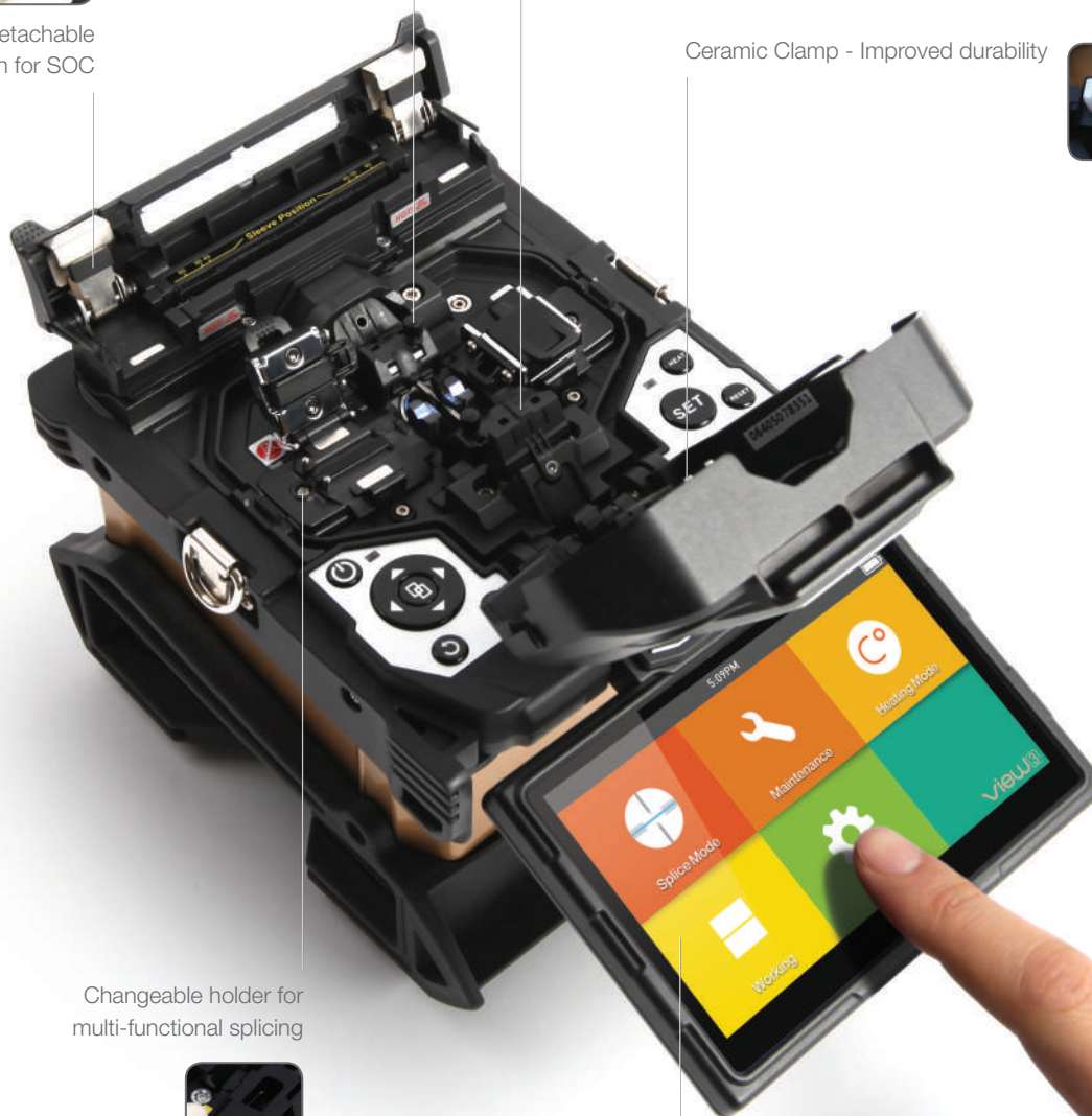
Changeable holder for multi-functional splicing