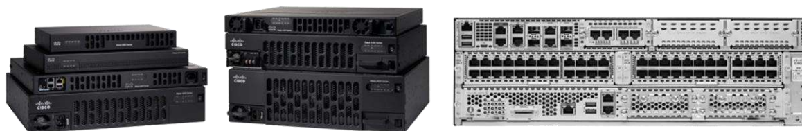
Figure 1. Cisco 4000 Series Integrated Services Routers

The ISR 4000 Series contains the following platforms: the 4461, 4451, 4431, 4351, 4331, 4321, and 4221 ISRs.