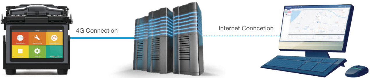
Your Fusion Splicer

Facilitates the management of multiple devices and work progress by tracking device in real time and generating report based on server data. Job order function allows manager to give work direction to operators which has enrolled device.