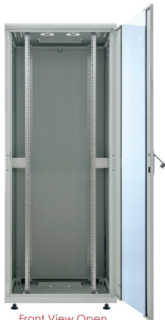
Front View Open