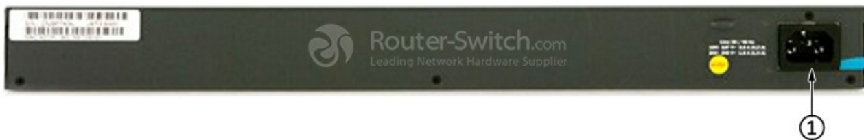
Figure 3 shows the back panel of Aruba J9772A.