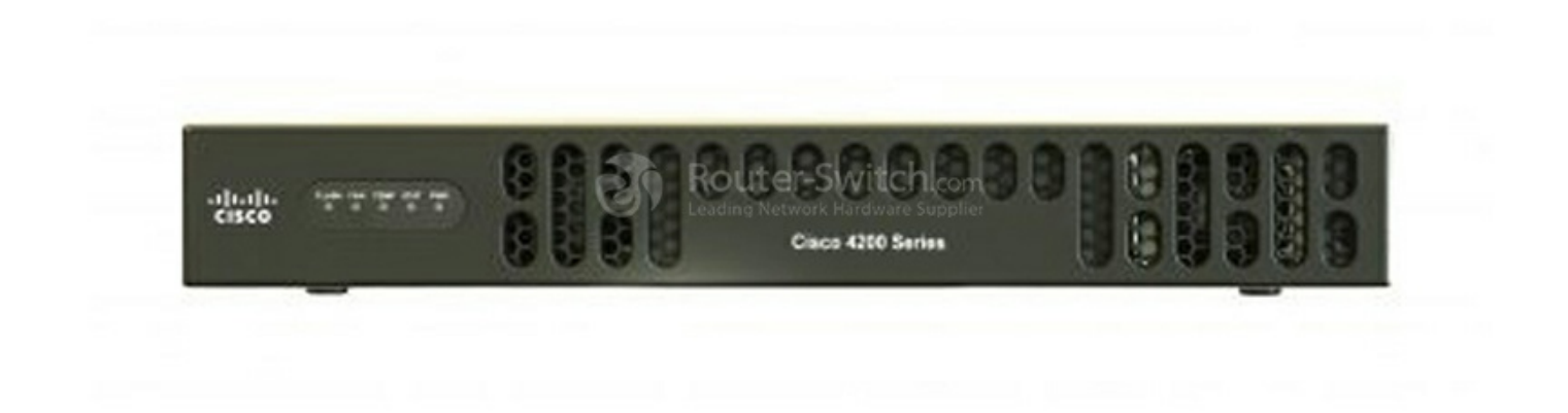
Figure 1 shows the LEDs on the front panel of the Cisco ISR4221-SEC/K9.